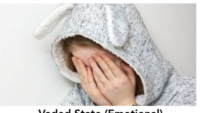
Vaded State (Emotional) Reprocessing - Fear or Rejection

In addiction and other unwanted behaviours that clients regret, Vaded States are triggered, flooding the conscious with overwhelming emotions. The Retro State quickly steps and works to avoid the unwanted feelings.